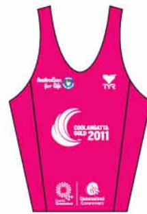
Masters 30+ Female