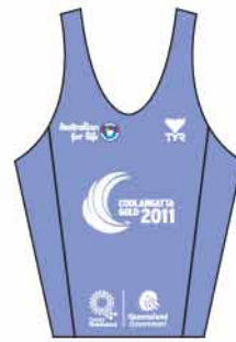
Masters 50+ Male