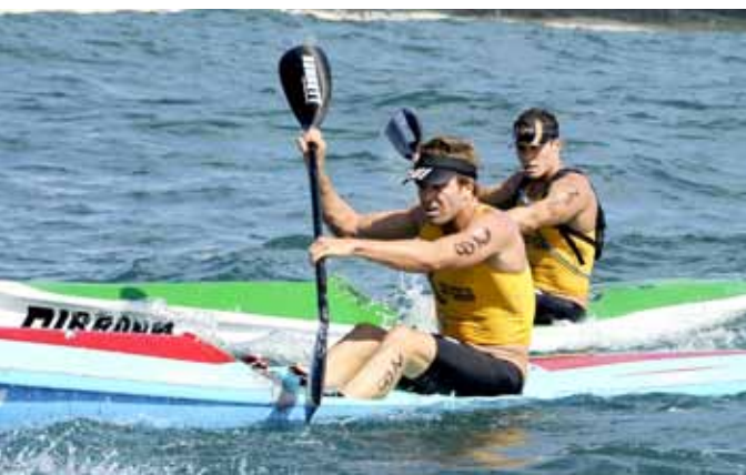
TOUGH TASK: Competitors head south to Coolangatta and the 23km ski leg