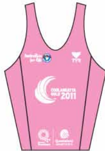
Under 19 Female