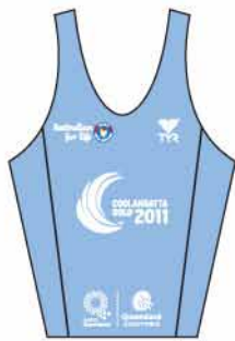
Under 19 Male