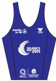
Masters 30-39yrs Male