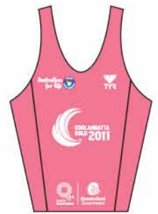
Masters 40+ Female