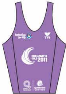
Under 19 Female Teams