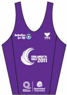
Open Female Teams