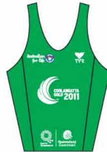
Open Mixed Teams