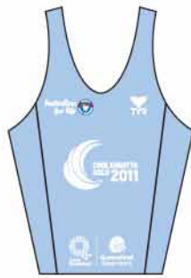
Masters 40+ Male