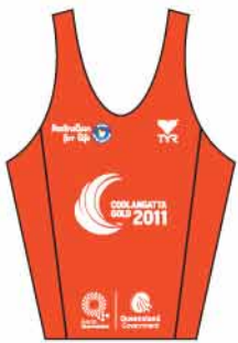
Under 19 Male Teams