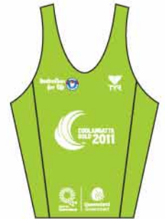
Under 19 Mixed Teams