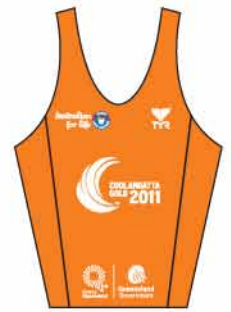
Open Male Teams